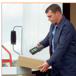
Express and Parcel delivery

The business approach and the flexibility of the mobile software allow Collect'n deliver offering to address the multiple facets of the goods delivery business.