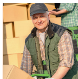
Sector-specific delivery fleets