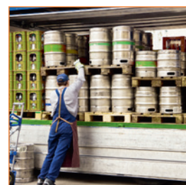
Private and sector-specific logistic fleets